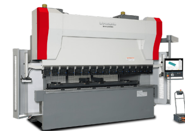
LNC Press Brake